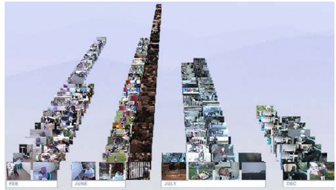
Figure 2: Clustered-time view of query results.

interestingness. We also want to minimize the action needed to have a sense of what something is, so we display thumbnails of increasing size on mouse hover, and have an optional preview window for the selected item. Additionally, there are optional windows to show annotations, collections and children. With all these windows open, you can quickly see what a resource is, and what it is linked to.