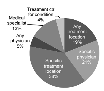
Figure 2. Distribution of resource targets in HUI queries.

treatment for a symptom or condition (e.g., [back pain, peoria illinois] ); (v) a specific treatment location (e.g., [tacoma urgent care] ); and (vi) any treatment location (e.g., [emergency clinic in sacramento] ). The distribution of these six resource targets across all HUI queries is displayed in Figure 2.