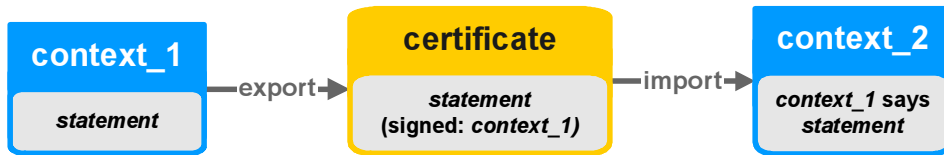
Figure 2. Communicating contexts