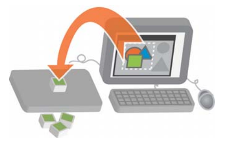
Figure 2: Extending the desktop environment with a physical interface for working with clips.

new clip and of introducing the key as its control. Keys can be rearranged and clustered into meaningful groups and removed to the effect of also removing the corresponding clipboard item from the computer. Clips can also be exchanged between two systems by moving keys between surfaces. In order to retrieve the content into an application, the user simply presses the appropriate key.