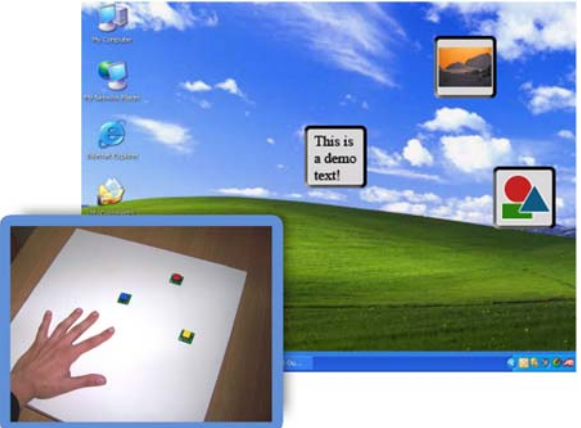
Figure 3: The clipboard content can be viewed by pressing on the surface, with thumbnails shown in a layout corresponding with the spatial layout of the physical interface.

Our system assumes a standard workstation environment with a windowing operating system, and extends this with a surface and set of keys that can be attached on the surface.