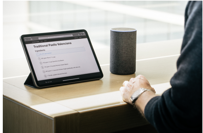
Figure 2: Multi-device support with the AskChef application built on our MDX framework, showing a smart speaker and a tablet device being used simultaneously.

Recipe preparation is a good example of a common scenario in daily life in which people benefit from having an assistant which can guide them through the multiple steps of the recipe. Presence of multiple smart devices in kitchen spaces also makes it an excellent example of how MDX task support can be provided to users. Smart speakers are often placed in the kitchens of homes [44]. Digital assistants are often used for aspects of cooking such as setting timers or managing related processes [21]. In their current form, these assistants help users follow the step-by-step instructions that comprise recipes [51, 60]. Early discourse models in the recipe domain (e.g., [22]) have extended into coaching scenarios, where the user is guided during the preparation of a recipe using spoken dialog