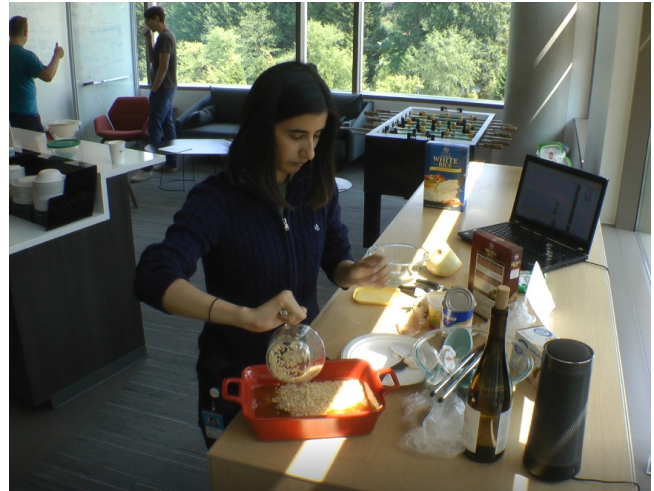
Figure 1: Example of a user cooking a recipe with assistance from a multi-device cooking application, AskChef . The application provides a recommendation for every step and leverages the capabilities and modalities of the devices available at cooking time (in this case, a smart speaker (lower right of the figure) and a laptop (middle right of the figure)).