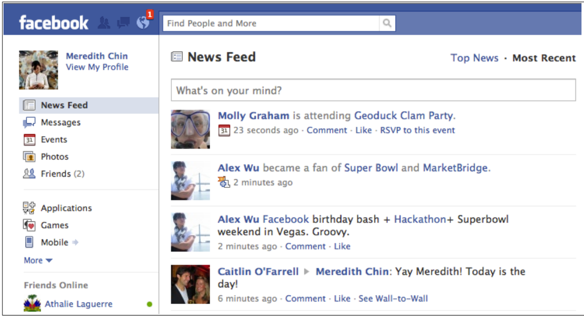
Figure 1: Facebook’s News Feed is the canonical example of a networked information feed. ”Top News” represents a filtered NIF, whereas ”Most Recent” provides an unfiltered NIF.

NIF is a reflection of individual action in the system. For any time period t , let us define the contents of a NIF as the finite sum of content items c shared by alters, where an individual has alters a ( a = 0 \dots n ). An individual’s NIF for period t can be represented as: