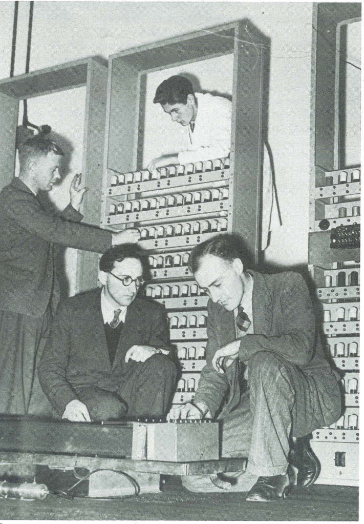
Computer pioneer Maurice Wilkes (wearing glasses) and his team are seen with the EDSAC computer ca.1950.