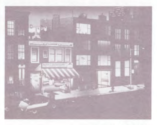
"Imagine: Art With the Macintosh" in the William C. Norris Gallery.

The Computer Museum presents a dazzling exhibition of full color art created with the Macintosh computer. Selected works emphasize original and creative use of the medium. Produced by Verbum , a quarterly journal of personal computer aesthetics. In the Museum's William C. Norris Gallery.