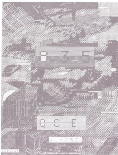
▶ Frontispiece by Ed Roxburgh From a series of digital paintings using Full Paint on the Macintosh.