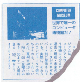
▲ As these headlines show, the Museum attracts media attention around the world.