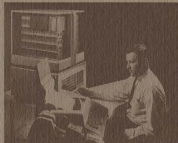
PDP-8 (late second generation)