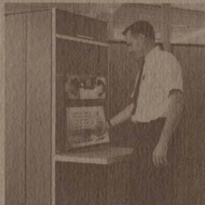
PDP-1 (early second generation)