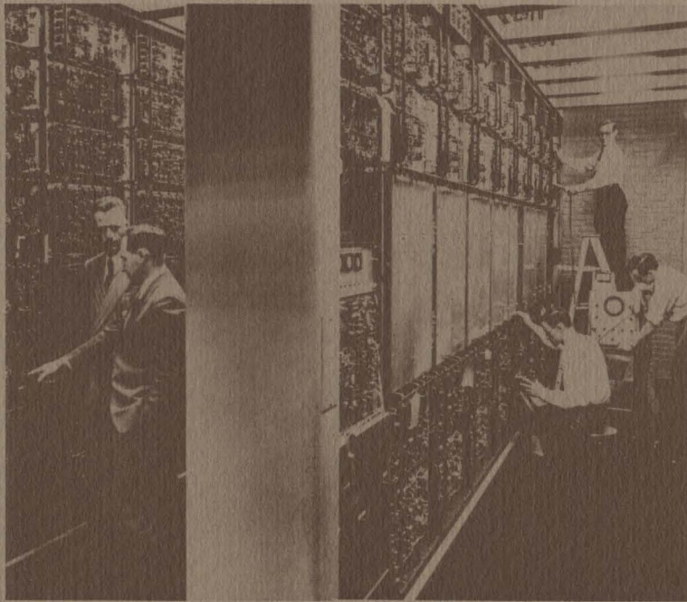
MIT Whirlwind (very early first generation)