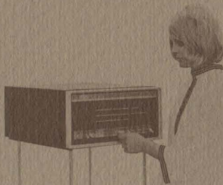
PDP-8/L (8/I derivative; mid third generation)