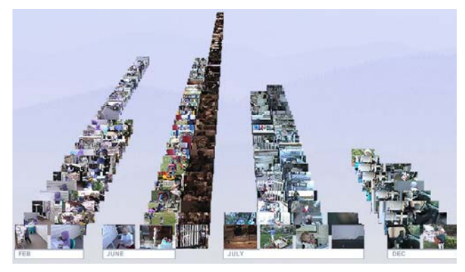
Figure 2: Clustered-time view of query results.

interestingness. We also want to minimize the action needed to have a sense of what something is, so we display thumbnails of increasing size on mouse hover, and have an optional preview window for the selected item. Additionally, there are optional windows to show annotations, collections and children. With all these windows open, you can quickly see what a resource is, and what it is linked to.