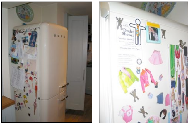
Figure 1. Left and right side of Olivia's family fridge.

In the second example, the expanse of space and the orientation of a fridge's surfaces are used to give some order to what is attached. Affixed to the fridge's sides (Fig. 1) are an assortment of letters, notes, lists, invitations, train tickets, etc. all placed in and amongst a scattering of magnets of various shapes and sizes. In this particular case, the retro-styled door of the fridge is kept clear in part because it is made of molded plastic (i.e., non-magnetic), but also perhaps to retain and exhibit its distinctive aesthetic.