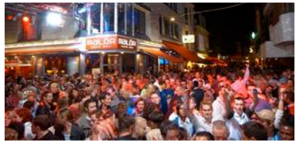
Figure 1: The annual city festival in the center of Oldenburg

remains that one has to look out for the others in short intervals in order to keep the group together. Sometimes we actually lost one of our friends for that night. Keeping the group together is valuable, but since everyone constantly has to look out for the others and thus spends less attention to attractions and other people it decreases the fun factor of the city festival visit.