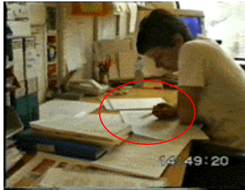
Figure 1. The layout of source documents and paper-based plan for the purposes of comparing and contrasting information.