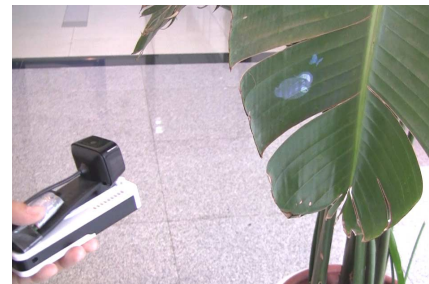
Figure 1: PicoPet prototype.

Although our vision is to run PicoPet on mobile devices with embedded projectors, as a proof-of-concept prototype it is currently implemented by combining a standalone handheld projector, a webcam, and an Inertial Measurement Unit (IMU). These are all connected to a laptop PC which can be easily taken to various environments.