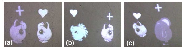
Figure 4: Interaction between two pets: (a) Mutually attractive - walk towards each other. (b) Mutually repelling - walk away from each other (c) One pet tries to catch the other pet, while the other runs away.