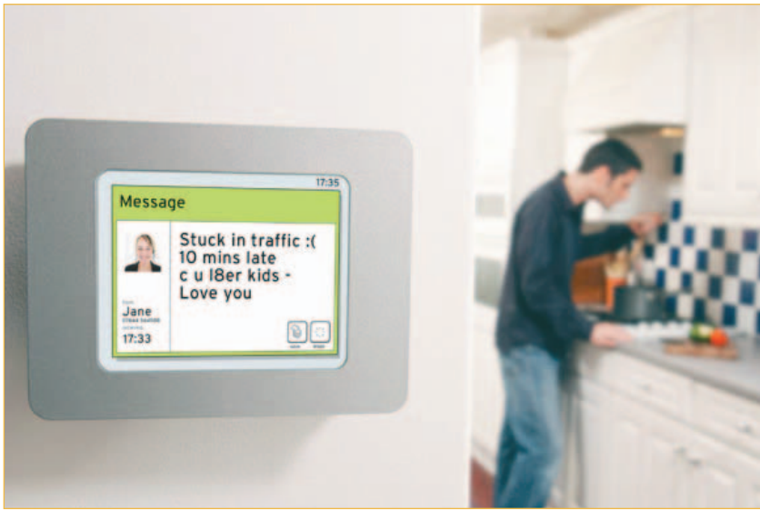
Figure 1. The Appliance Studio's txTboard. The wall-mounted device displays SMS messages from family members or friends to its own phone number.

traffic to maintenance engineers, but text soon evolved into a channel for communicating about intimate and private matters. An e-mail, by way of contrast, is relatively longer and more official, although still relatively collegial. An e-mail has these properties in part because of its content, where it arrives, and how the recipient deals with it—such messages typically are triaged rather than being dealt with immediately. Nor are most e-mails intimate; after all, they arrive in one's